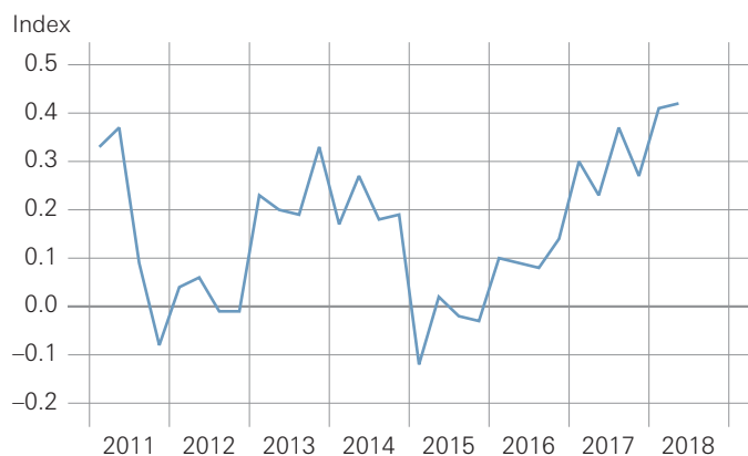
Expected developments in staff numbers over the coming two quarters. Positive (negative) index values indicate higher (lower) expectations.