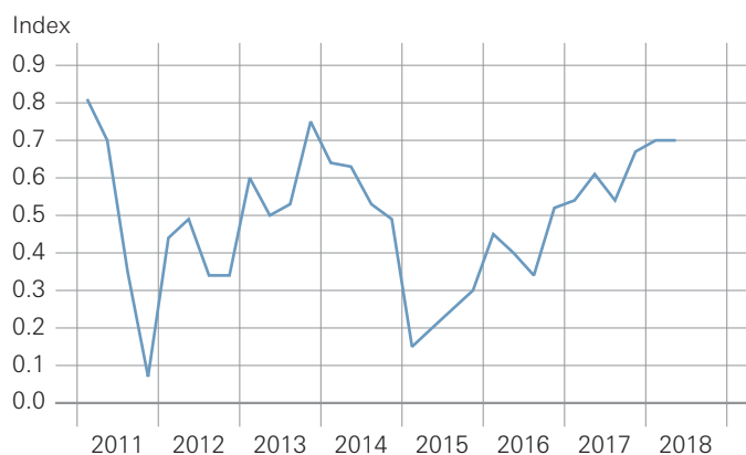
Expected developments in real turnover over the coming two quarters. Positive (negative) index values indicate higher (lower) turnover expectations.