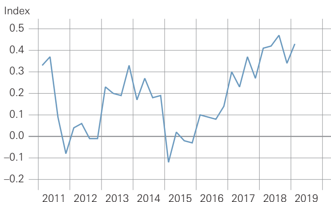
Expected developments in staff numbers over the coming two quarters. Positive (negative) index values indicate higher (lower) expectations.