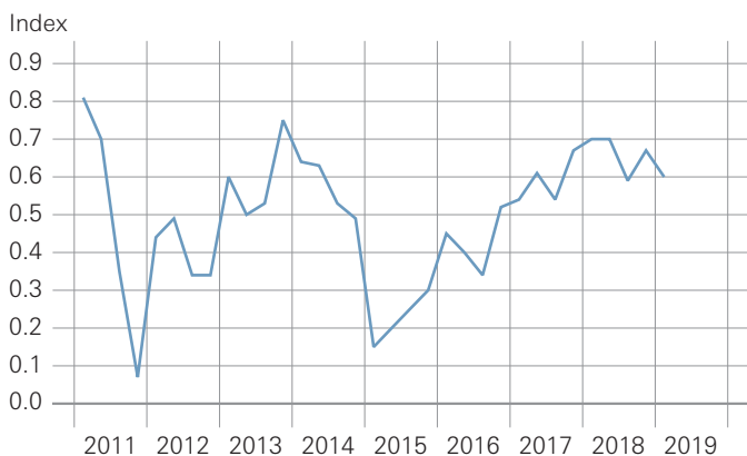
Expected developments in real turnover over the coming two quarters. Positive (negative) index values indicate higher (lower) turnover expectations.