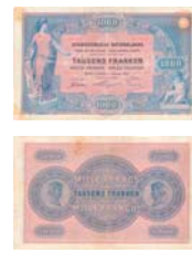
1 st series 1907–1925