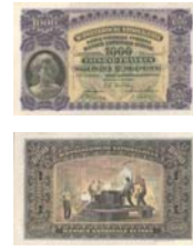
2 nd series 1911–1958 (1980)