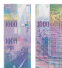
8 th series from 1995