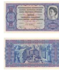
4 th series never issued