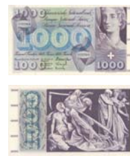
5 th series 1956–1980