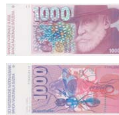
6 th series 1976–2000