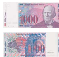
7 th series never issued