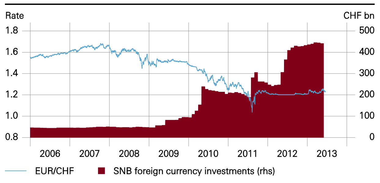
CHART 1: EUR/CHF AND SNB FOREIGN CURRENCY INVESTMENTS