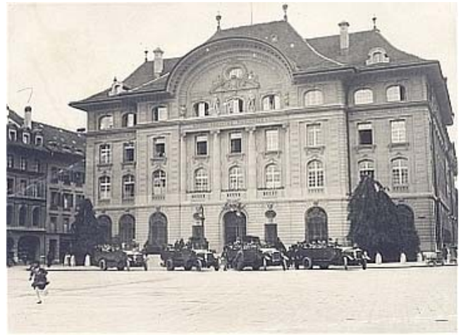
Main building in Berne in the twenties

The 'Chronicle of monetary events' lists all the most important laws, enactments and decisions in connection with monetary policy since 1848. The 'Biographical profiles' contain information on the professional and political careers of all the former and current Presidents of the SNB's Bank Council and all of the members of its Governing Board, together with a photograph in all cases. The 'Publications' section includes the four SNB commemorative publications. Information on the centenary celebrations of the SNB in 2007 may be found under the heading, 'SNB's centenary'. 'Information on the archive' provides information on the holdings in the archive and the conditions for access.